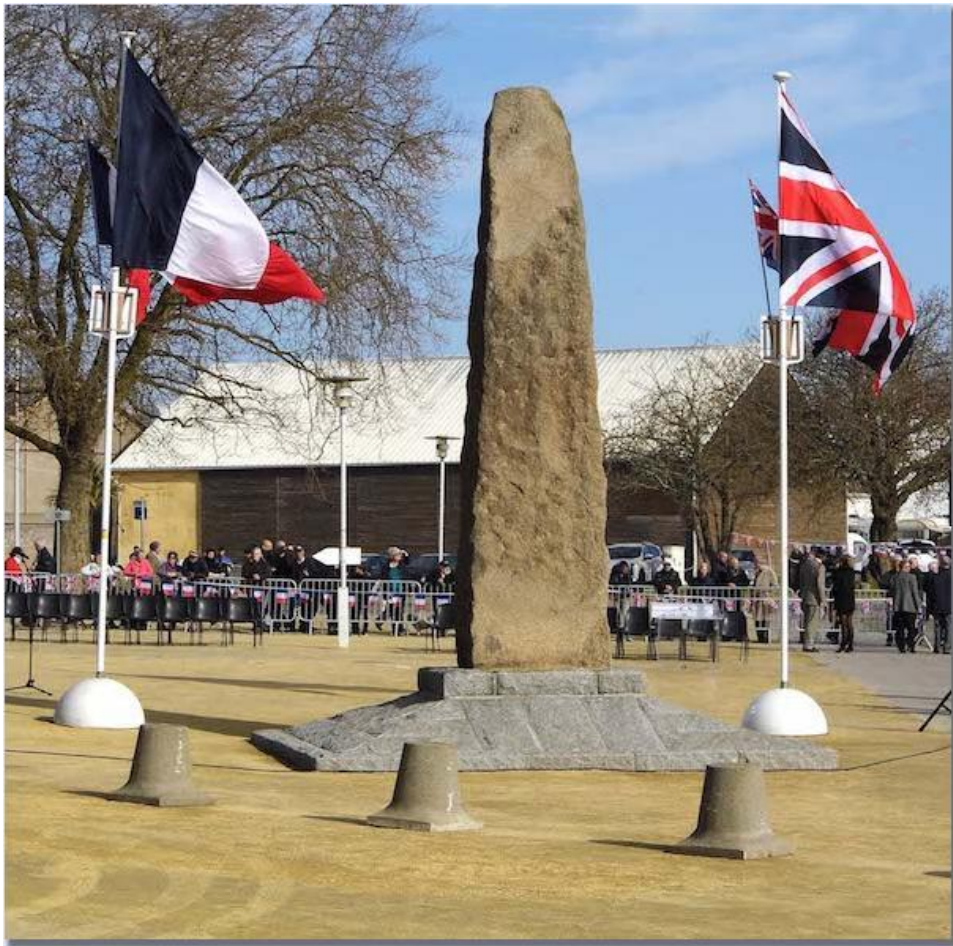
The Monument du Commando in its new location, just prior to the 75th Commemoration of Operation Chariot.

The maintenance of close ties with the town and people of Saint-Nazaire was a founding principle of the Society; and right from the first Committee meeting the placing of a simple plaque somewhere in the dock area had been a subject of much discussion. When the French